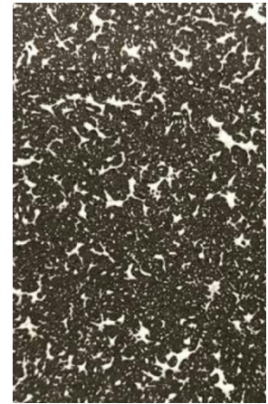
150 Square Feet